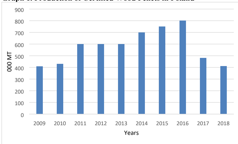
Graph 1. Production of Certified Wood Pellets in Poland